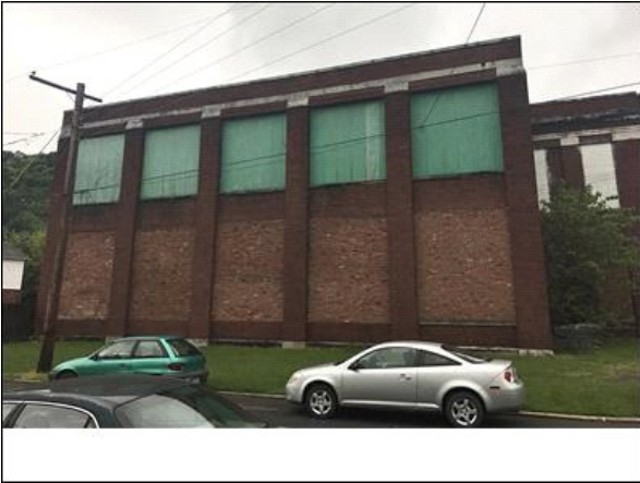
D&H Warehouse Exterior Pict 1.jpg