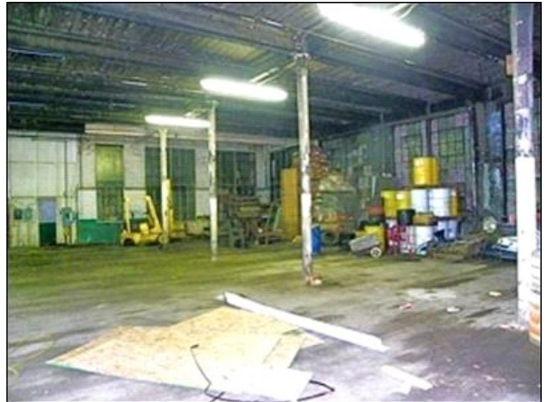
D&H Warehouse Interior Pict 2.jpg