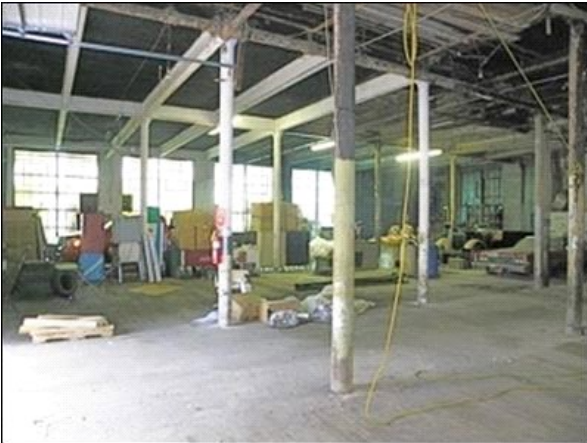
D&H Warehouse Interior Pict 1.jpg