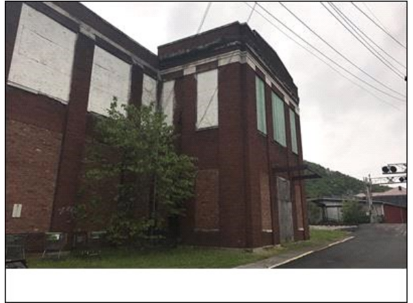
D&H Warehouse Exterior Pict 2.jpg