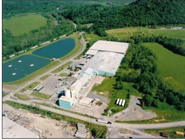
Anchor Glass Facility Aerial.jpg