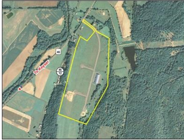
Fort Ashby Business and Technology Park.jpg